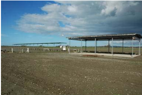
Carpark and shelter (carpark has been harrowed)