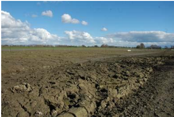
Blocked creek from roadway