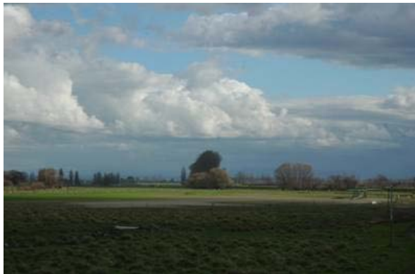
Field from the top of the stop bank by the gate