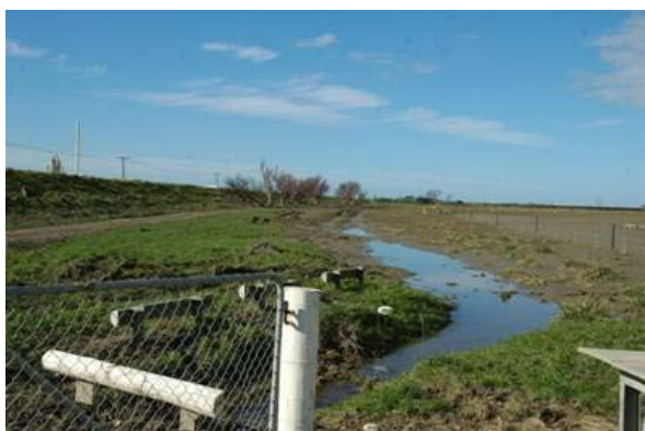
Blocked creek with standing water (now stagnant!)