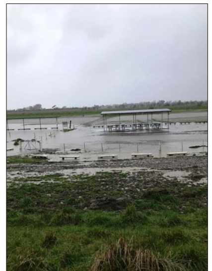
Yes, we had a tad more rain.... which made the field look like this....