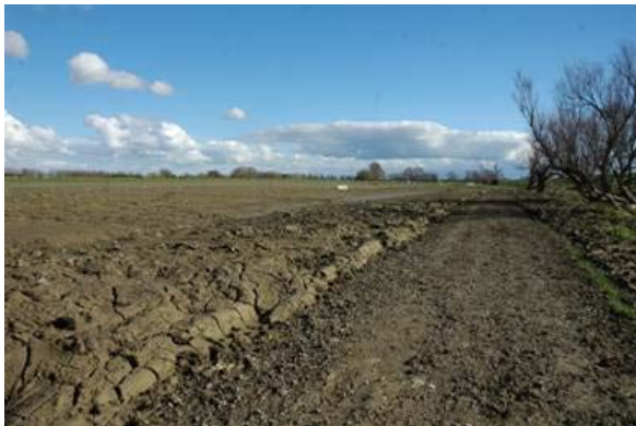
Roadway... has had a contact grader down it.