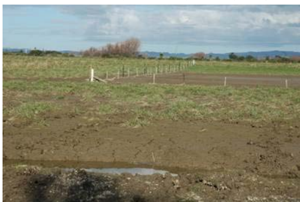
Eastern end (near ocean) with new fence added.