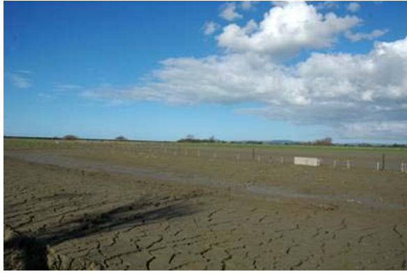
Northern fence from the roadway (Yes that is a table tied up in the fence!)