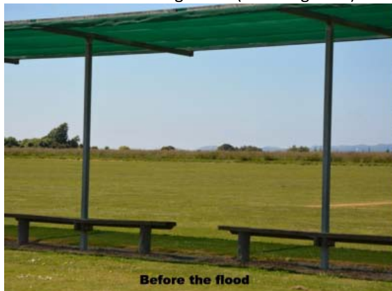
Before the flood