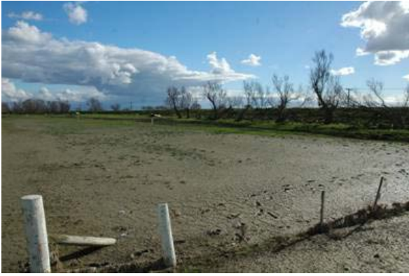
Field extension – very soft and wet!